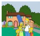
Nuclear jokes far from 1st 'Simpsons' fuss