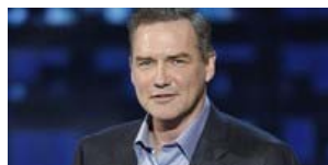
Norm Macdonald's new show updates 'Weekend Update'