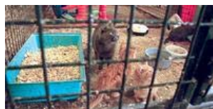
Controversial roadside zoo up for permit renewal: SRD