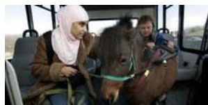
U.S. allows miniature horse as service animal