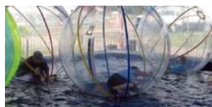
U.S. says 'water walking balls' are not safe