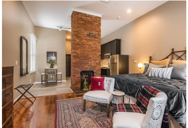
The Bourbon King