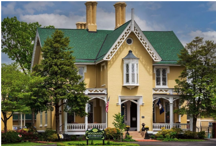
The Inn at Woodhaven